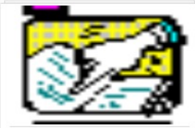
LBBTN Work Queues