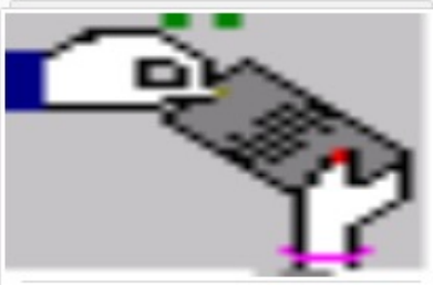
Do Not Process