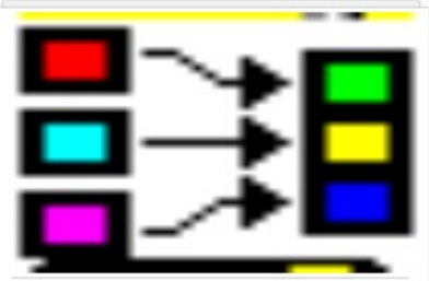
LBBTN Purchase Offer Selection