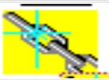
Chain Of Title Errors